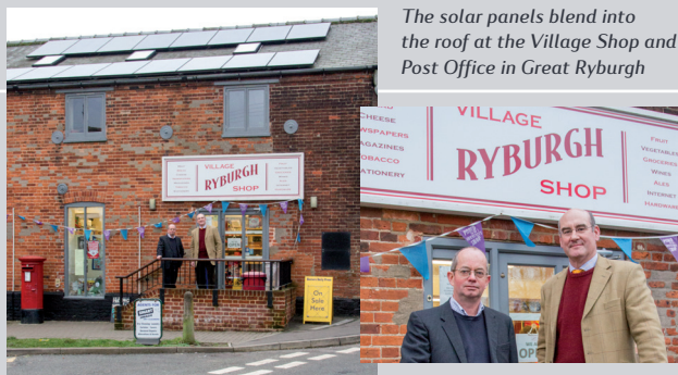
The solar panels blend into the roof at the Village Shop and Post Office in Great Ryburgh