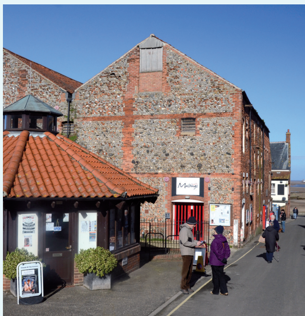
The Maltings in the heart of Wells-next-the-Sea, previous recipient of a grant from the Sheringham Shoal Community Fund

A wide range of organisations have successfully applied for grants from the Sheringham Shoal Community Fund. The case studies give an insight into just two of the numerous projects which have been able to proceed due to contributions from the Fund.